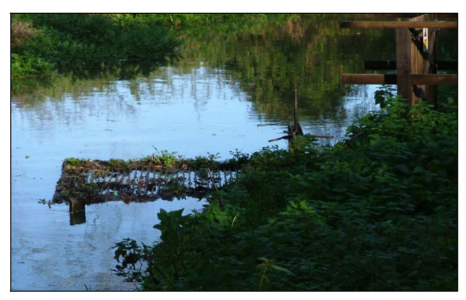
Photograph 7.1 - Sluice for compensation flow to River Lud upstream Keddington Church Lock

Along the canal's length there are control sluices that allow compensatory flows back into the River Lud for agricultural and ecological reasons (see Photograph 7.1). These sluices (or 'slackers') were installed in the banks of the canal to enable riparian landowners to release water from the canal into the adjacent ditches and dykes to maintain water levels in those ditches for stock watering, 'fencing' and subsoil irrigation purposes. Following the passing of the Water Resources Act in 1963 the use of the 'slackers' by the Internal Drainage Board was subject to an abstraction Licence.