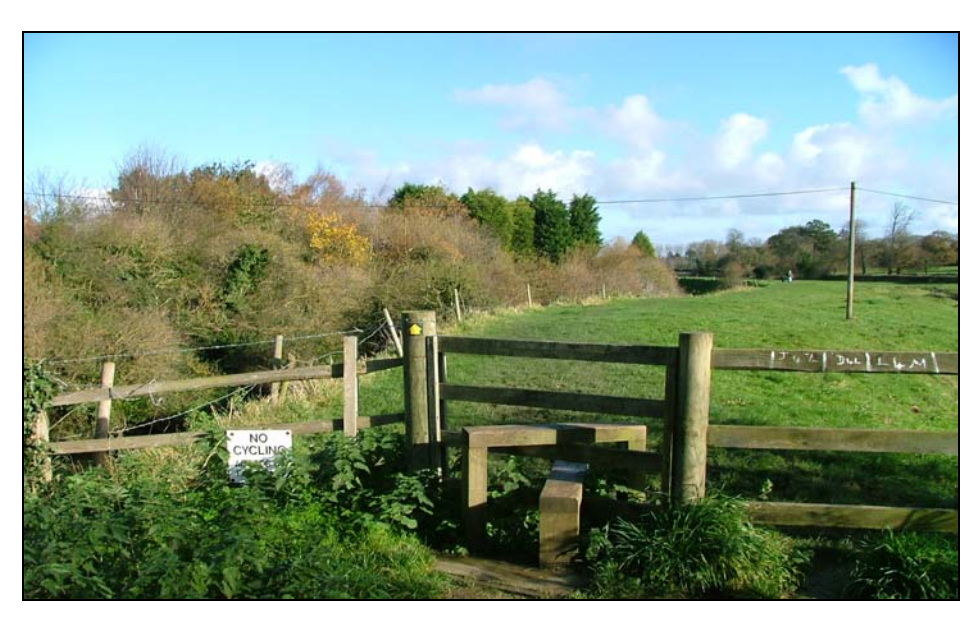
Photograph 13.1 - Timber Stile between Keddington Church Lock and Ticklepenny Lock

■ There is a significant pinch point at Thoresby Bridge where the towpath is narrow due to adjacent buildings creating an obstruction to wheelchair users. If the canal cannot be narrowed to provide additional towpath width it maybe possible to negotiate access through adjacent private land (see Photograph 13.2).