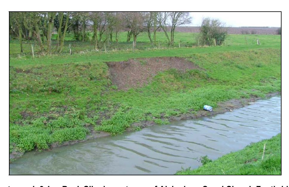
Photograph 3.1 - Bank Slip downstream of Alvingham Canal Church Footbridge

The Canal is classified at a Main River.