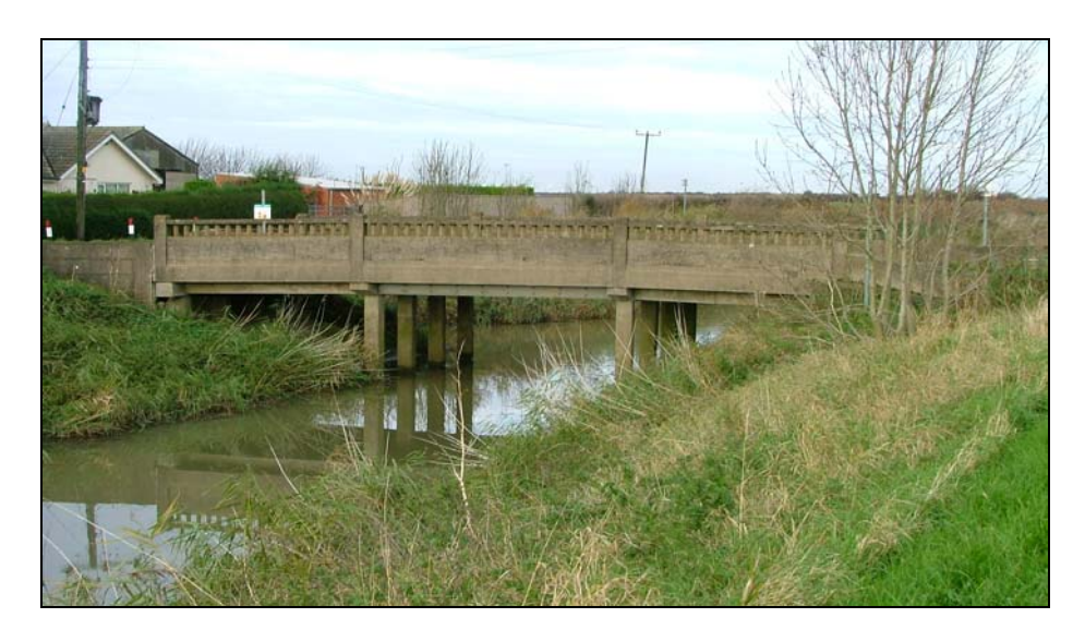
Photograph 5.7 - Austen Fen Bridge

part of the dredging works. The existing deck level provides insufficient headroom. The bridge requires raising by approximately 0.5m. Due to these works the bridge would need replacing in its entirety.