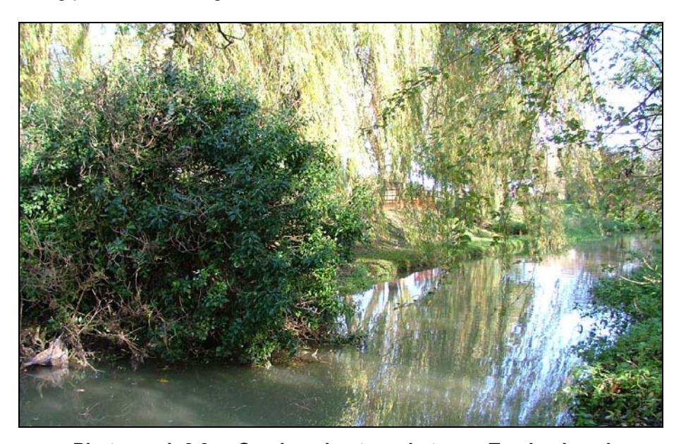
Photograph 3.3 - Overhanging trees between Top Lock and Keddington Church Lock and erosion of bank toe

There are a number of trees within the canal banks, some of which overhang the main channel and would require cutting back as part of any restoration works (see Photograph 3.3). Principally, trees within the canal banks are located at the canal's upstream end around Riverhead & Keddington and upstream of Fire Beacon Bridge. Since the canal was abandoned the wharf running along the left bank between Riverhead and Top Lock has been partly infilled and planted over with trees. These would need to be removed as part of any restoration to provide a turning point and moorings.