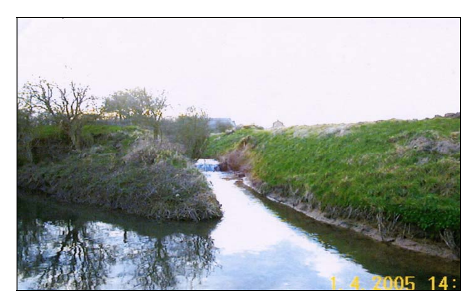
Photograph 7.3 - Lindsey Marsh Drainage Board Westfield Drain Weir