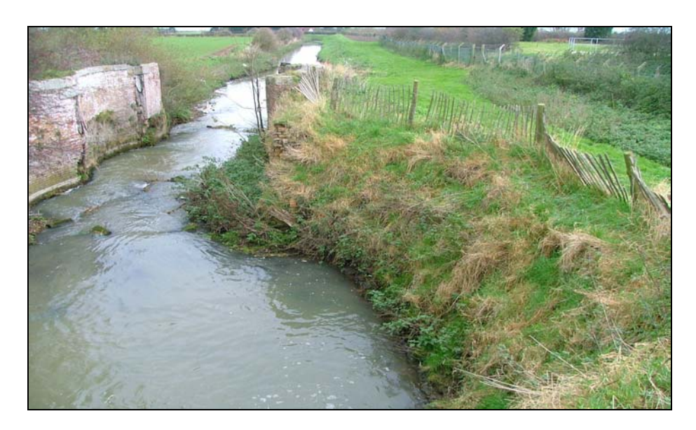
Photograph 4.3 - Salterfen Lock - Note gates have been removed

4.8 Willows Lock – This lock, sometimes referred to as Carrotts Lock, consists of barrel arch sided brick walls with stone copings (see Photograph 4.4). The lock is in a reasonable condition except for the invert, which due to its timber beam construction has been subject to significant scour. The original invert timbers have decayed increasing the amount of scour. The walls are showing signs of leading inwards. However, of all the locks along the Louth Canal, Willows Lock is the best remaining example of the unique barrel arch wall design and should be restored.