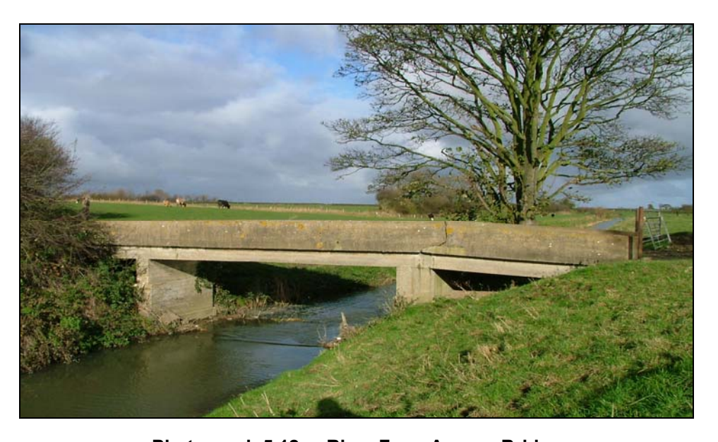
Photograph 5.12 - River Farm Access Bridge

River Farm Bridge (see Photograph 5.12) – With sufficient water depth no dredging is required at this location but the existing deck level provides insufficient headroom. A swing bridge as with the original Navigation or new bridge raised by 1.8m is required.