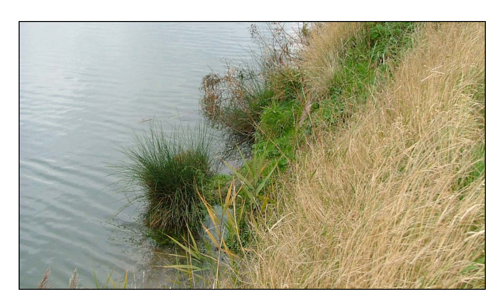
Photograph 3.4 - Bank erosion downstream of Fulstow Footbridge