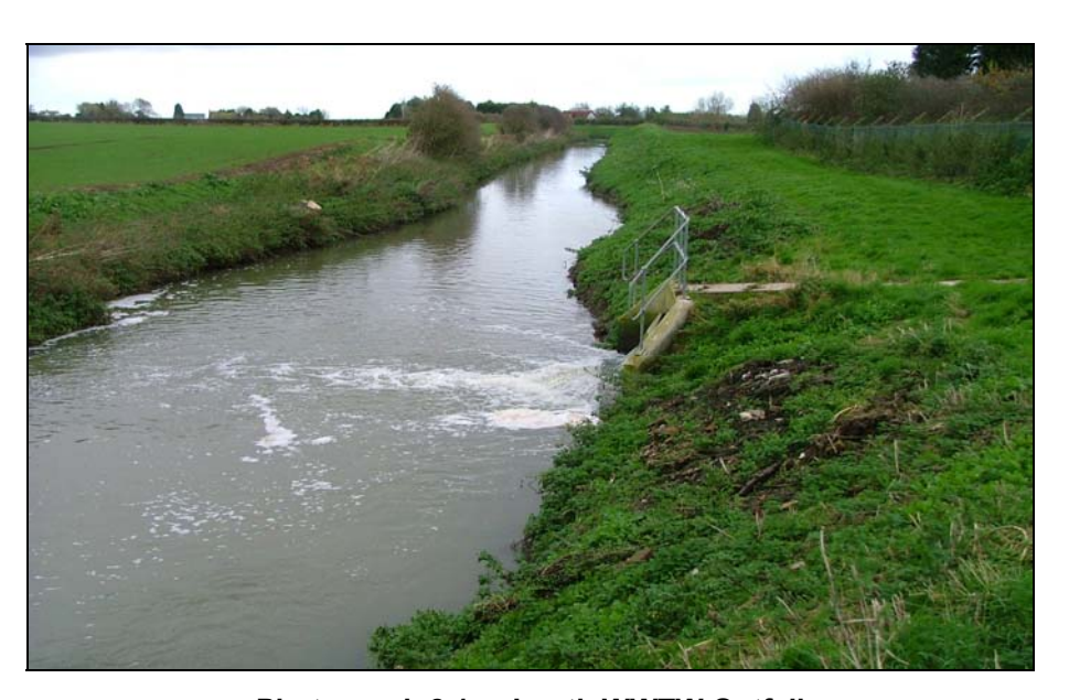
Photograph 8.1 - Louth WWTW Outfall