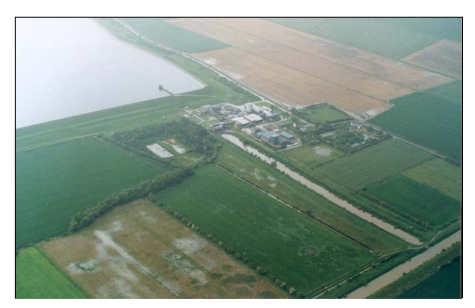
Photograph 2.4 - Covenham Reservoir and intake channel from the Louth Canal

At the Riverhead in Louth the Navigation Warehouse, a Grade 2 listed building, built in the 1770's as a wool and corn store, was restored in 1998/9 to high environmental standards by a partnership between the LNT and Groundwork Lincolnshire.