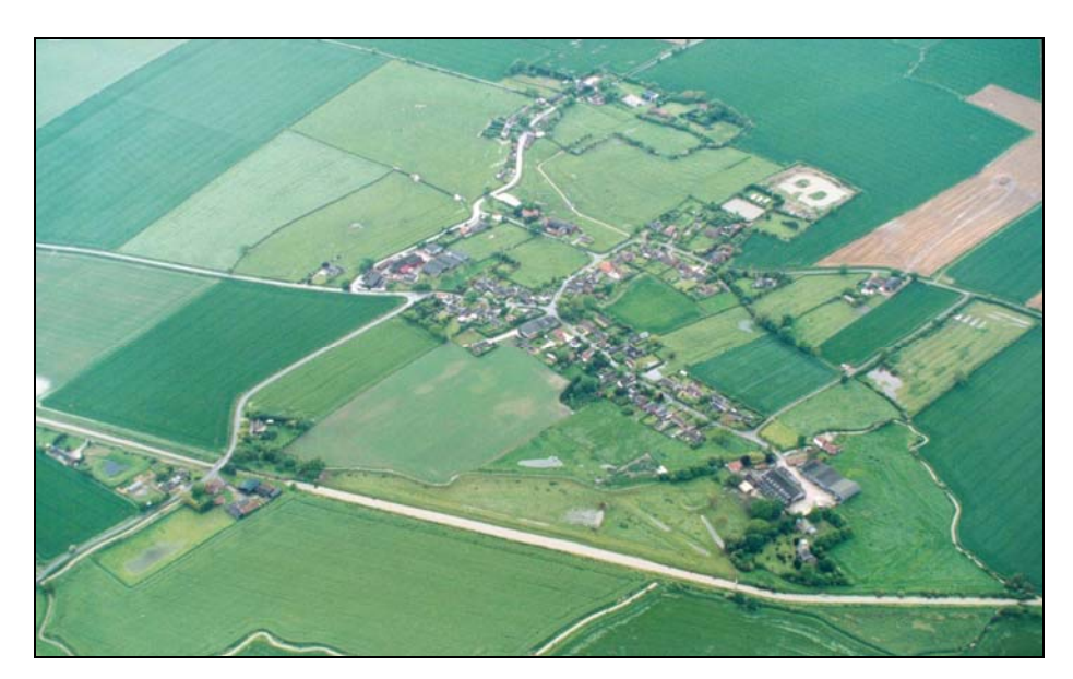
Photograph 12.2 - Aerial view of Alvingham