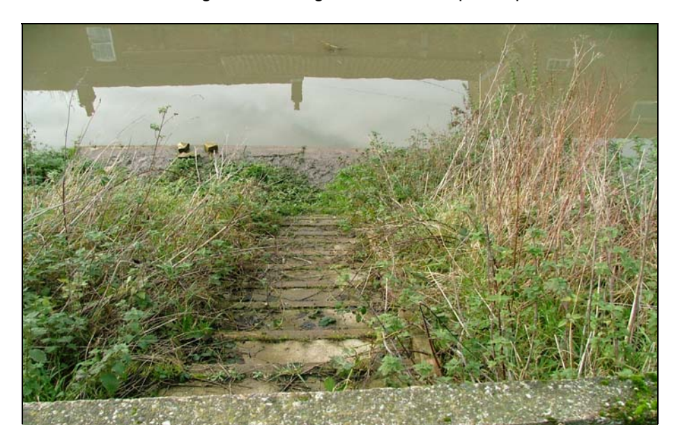
Photograph 3.7 - Derelict concrete landing stage/steps upstream of Austen Fen Bridge

Moorings should allow for flood flows. Boats should be allowed to rise and fall with the canal's fluctuating water levels.