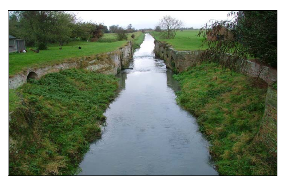
Photograph 4.2 - Alvingham Lock - Note gates have been removed

Alvingham Lock – This lock consists of barrel arch sided brick walls with stone copings (see Photograph 4.2). The lock is in a reasonable condition. A modern fixed bridge of concrete construction has since replaced the original timber swing bridge located immediately upstream of the lock. Restoration of the existing chamber to navigation would require that road to be either raised, moved or a swing bridge installed. The Alvingham Mill Race is syphoned below the canal between the lock and the road bridge. This upper syphon is also a listed structure.