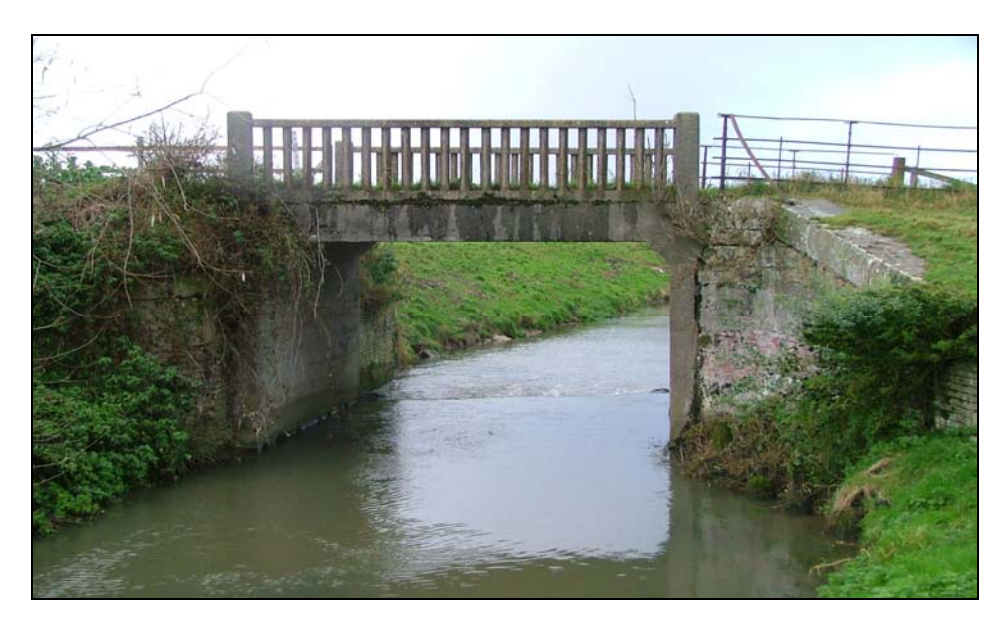
Photograph 5.9 - High Bridge

Alvingham Church Foot Bridge (see Photograph 5.10) — With insufficient water depth dredging of the channel by some 0.2m depth would be required at this location. The existing deck level provides insufficient headroom. The bridge requires raising by approximately 1.7m, such a rise would involve significant approach ramps. An alternative would be the installation of a swing bridge as with the original Navigation.