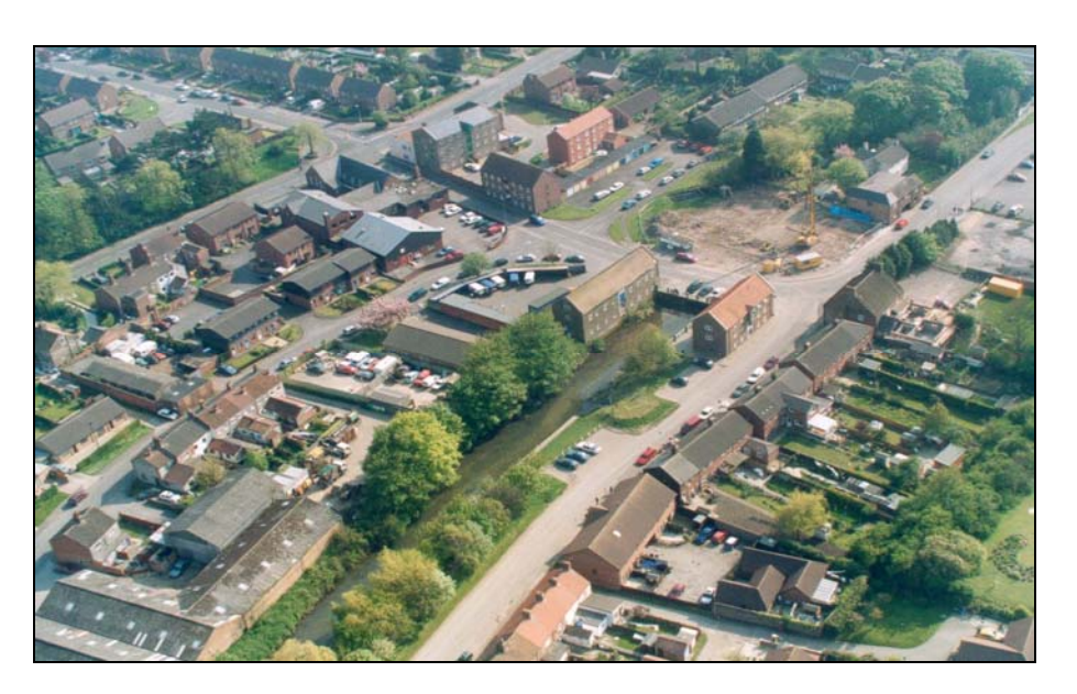
Photograph 12.1 - Aerial view of Riverhead Louth with Navigation Warehouse

12.74 With regard to the Riverhead area specifically, the area could become a centre for tourism and recreation. The Louth Play-goers Riverhead Theatre is already close by and there are opportunities for engaging with visitors about the heritage of the area and for retail in the already renovated warehouses. There is also a public house adjacent to the canal. Redevelopment could lead to this being an attractive visitor destination and a start-point for walks, cycle rides or boat trips along the canal to Alvingham or Tetney Lock.