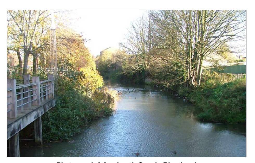
Photograph 2.2 - Louth Canal - Riverhead

This study covers the 18.9km of canal from the Riverhead (see Photograph 2.2) in Louth to Tetney Haven on the Humber Estuary and is situated in the heart of Lincolnshire. The extent and location of the canal is shown in Figure 1.