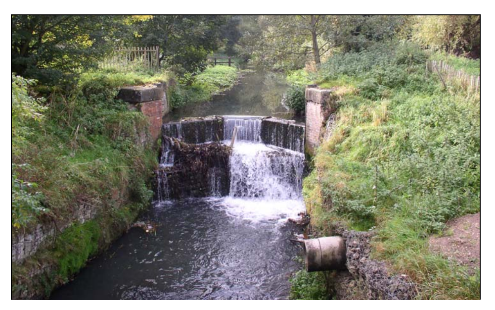
Photograph 4.6 - Keddington Church Lock - Note gates have been removed

Keddington Church Lock – This lock consists of barrel arch sided brick walls with stone copings (see Photograph 4.6). The Environment Agency has placed stone filled gabions to support the lock's deteriorating brick walls. The lock is in a very poor condition and a new lock is required. A fairly well used local path crosses the centre of the lock chamber. A fixed metal footbridge has replaced the original timber swing bridge. Restoration of the existing chamber to navigation would require that bridge to be either raised or moved.