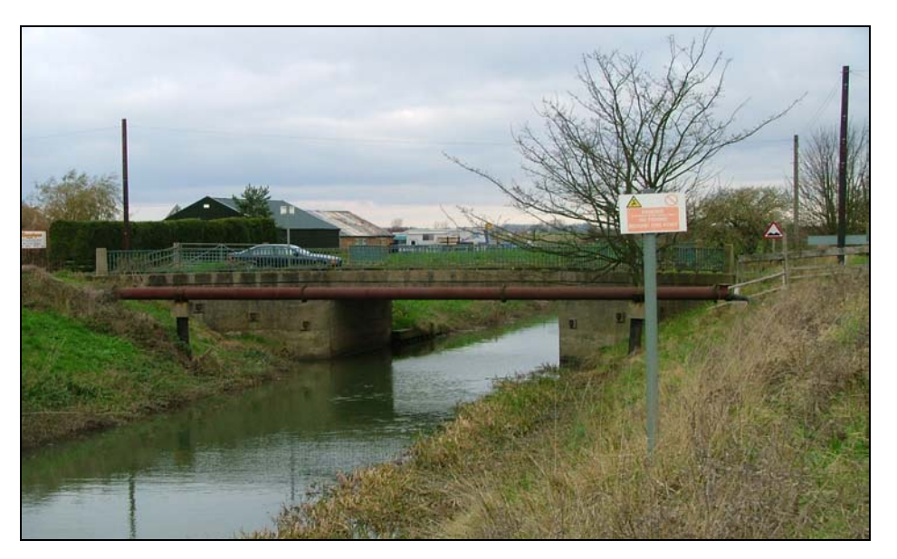
Photograph 5.5 - Fire Beacon Bridge and Pipebridge (water main)

Fire Beacon Road Bridge (see Photograph 5.5) – With insufficient water depth dredging of the channel by some 0.4m depth would be required at this location. The existing bridge deck nearly provides sufficient headroom, 2.96m as opposed to the required 3m. For the purposes of the study it is assumed that this bridge is not raised. However, any increase in the proposed retained water level although reducing the required dredging depth would reduce the available headroom with the result that the level of the bridge would then require raising. Due to the dredging, works to the foundations of the bridge would be required to maintain stability.