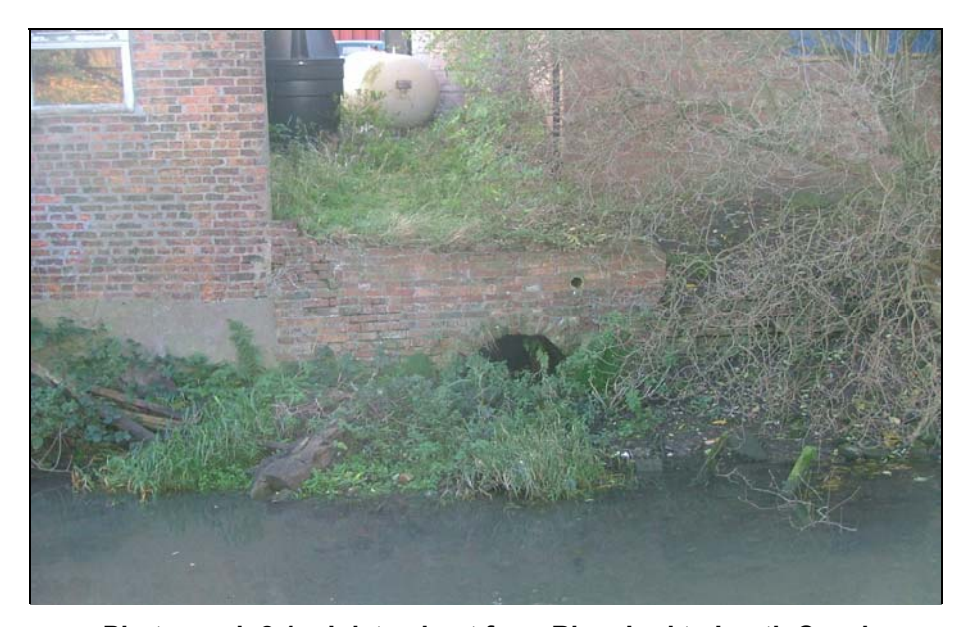
Photograph 2.1 - Inlet culvert from River Lud to Louth Canal at Riverhead (now abandoned)

Like many rural canals, the Navigation gradually fell into decline and disrepair towards the end of the 19<sup>th</sup> century as highways were improved and railways were developed. Its demise began when the Great Northern Railway took over the lease of the Navigation in 1846 and by increasing tolls, diverted goods onto the railway. The Navigation was seriously damaged in the 1920 flood and eventually closed in 1924 when the locks, together with the Riverhead area, fell into dereliction and decay.