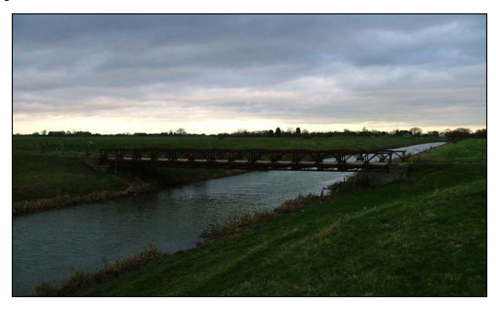
Photograph 5.2 - Riverside Farm Bailey Bridge

Bailey Bridge Riverside Farm (see Photograph 5.2) – With sufficient water depth no dredging is required at this location but the existing deck level provides insufficient headroom. The existing bridge requires raising by 0.8m, it should be feasible to lift and reutilise the existing bailey bridge.