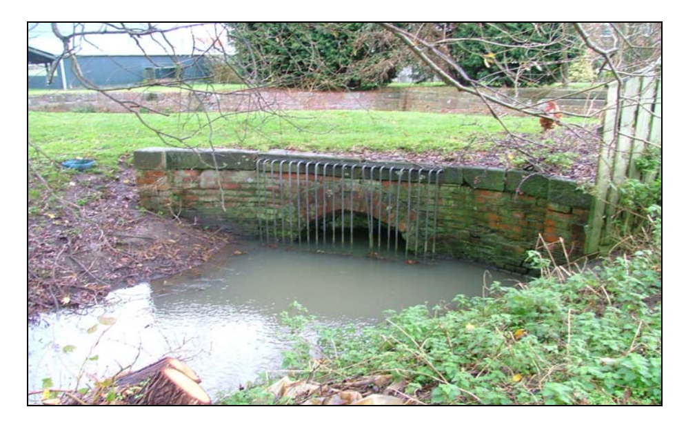
Photograph 7.2 - Alvingham Upper Syphon and Mill Stream (Upstream side)

The village of Alvingham and adjacent land drain by gravity into the Louth Canal via Westfield Drain. The Alvingham Mill Tail Race also discharges into Westfield Drain. Historically, Westfield Drain drained to the River Lud and when the Louth Navigation was constructed a brick culvert was built to convey flows in Westfield Drain below the canal (Alvingham Lower Syphon). A second brick culvert (Alvingham Upper Syphon) was also constructed to enable flows in the Alvingham Mill Race (Mill Stream) to be conveyed below the canal (see Photograph 7.2).