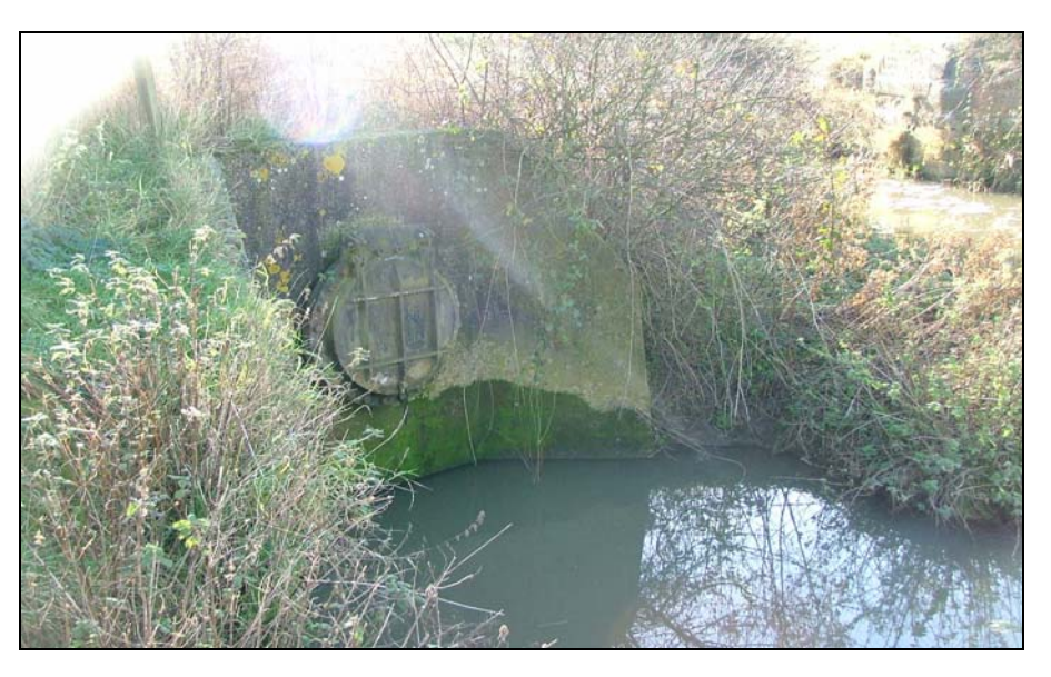
Photograph 8.3 - Outfall from Great Eau Raw Water Transfer Main

550m downstream of High Bridge (914mm raw water transfer main from Great Eau) (see Photograph 8.3).