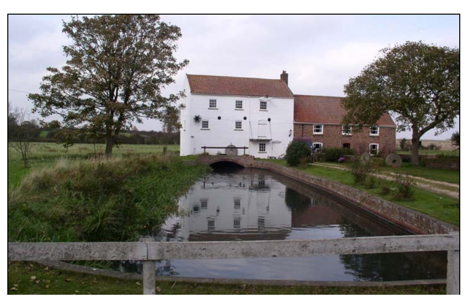
Photograph 7.5 - Alvingham Mill and Mill Stream

The second option would be to install a pumping station to pump all flows into the Navigation. There would be significant on going operating costs with this option, as all flows would need to be pumped into the Canal. To minimise flows, consideration could be given to minimising the flow along the Mill Stream to that required for ecological and Alvingham Mill operational interests (see Photograph 7.5). The Mill has been restored and is in use and therefore needs a reliable water supply.