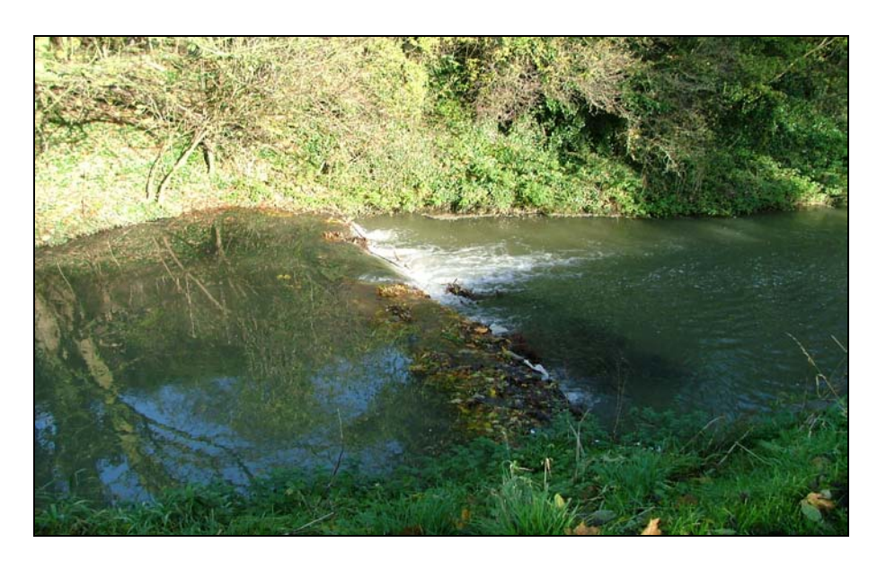
Photograph 8.7 - Weir (possible electricity cable) between Top Lock and Keddington Church Lock