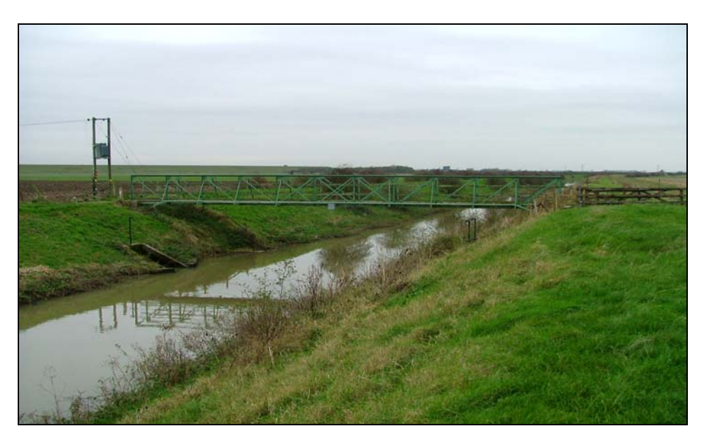
Photograph 5.6 - Biergate Foot Bridge and outfalls from LMDB Biergate Pumping Station

Biergate Foot Bridge (see Photograph 5.6) – With insufficient water depth dredging of the channel by some 0.5m depth would be required at this location. The existing deck level provides sufficient headroom and would not need to be raised. However, any increase in the proposed retained water level although reducing the required dredging depth would reduce the available headroom with the potential result that the level of the bridge would then require raising. To provide a bed width of 7.5m through the bridge could require its replacement. However, a reduction in the required bed width at this location would mean that this bridge could be retained. A reduction in design bed width to 4.6m has been assumed in this study.