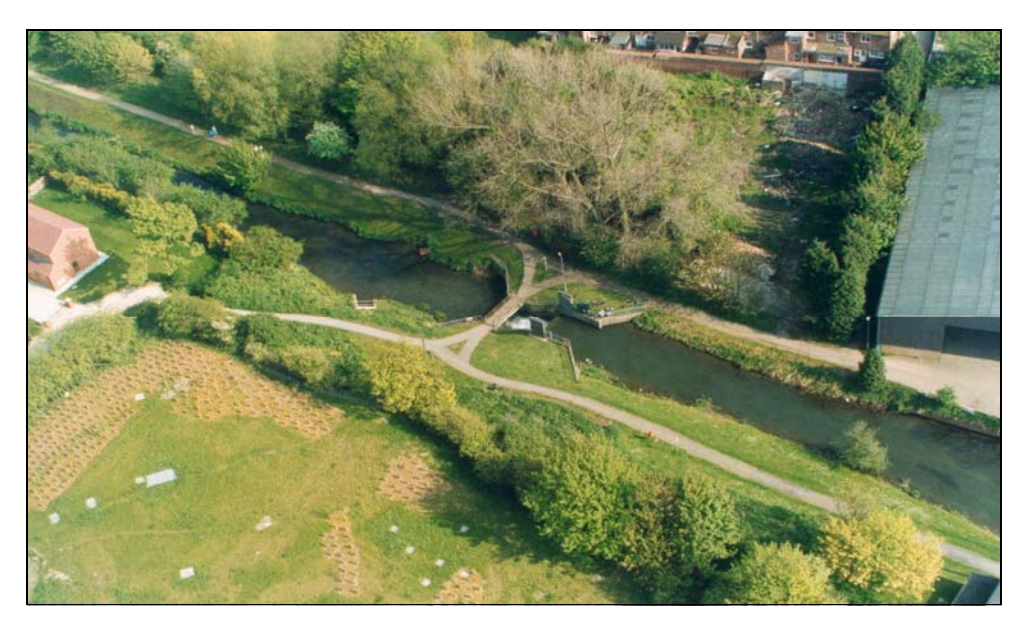
Photograph 4.7 - Environment Agency Louth Tilting Weir on site of old Top Lock