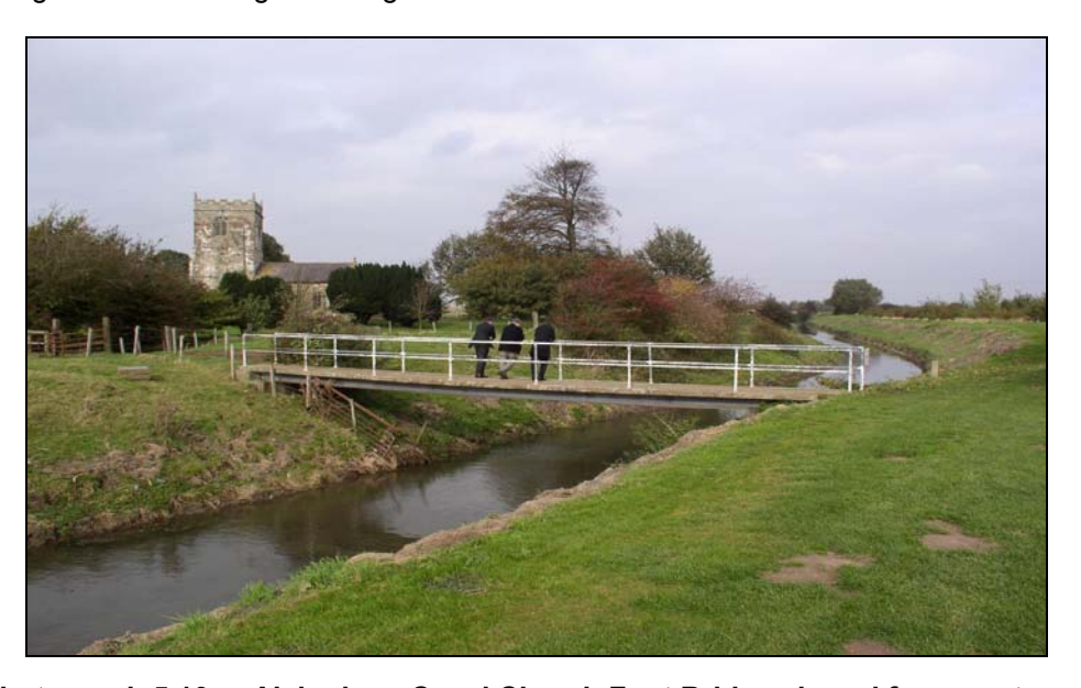
Photograph 5.10 - Alvingham Canal Church Foot Bridge viewed from upstream

Alvingham Church Foot Bridge (see Photograph 5.10) — With insufficient water depth dredging of the channel by some 0.2m depth would be required at this location. The existing deck level provides insufficient headroom. The bridge requires raising by approximately 1.7m, such a rise would involve significant approach ramps. An alternative would be the installation of a swing bridge as with the original Navigation.