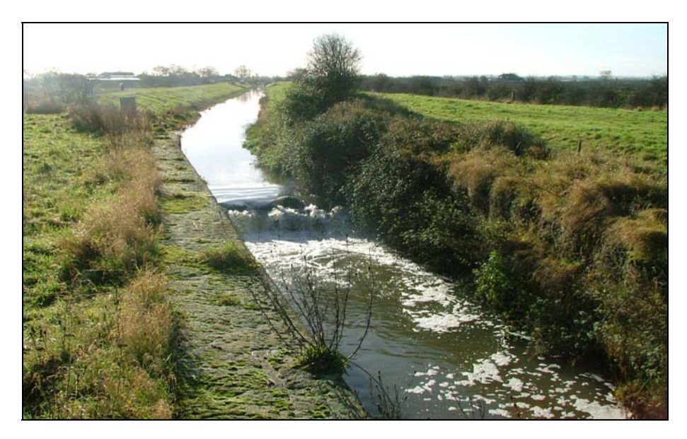
Photograph 4.1 - Outfen Lock - Note gates have been removed

Alvingham Lock – This lock consists of barrel arch sided brick walls with stone copings (see Photograph 4.2). The lock is in a reasonable condition. A modern fixed bridge of concrete construction has since replaced the original timber swing bridge located immediately upstream of the lock. Restoration of the existing chamber to navigation would require that road to be either raised, moved or a swing bridge installed. The Alvingham Mill Race is syphoned below the canal between the lock and the road bridge. This upper syphon is also a listed structure.