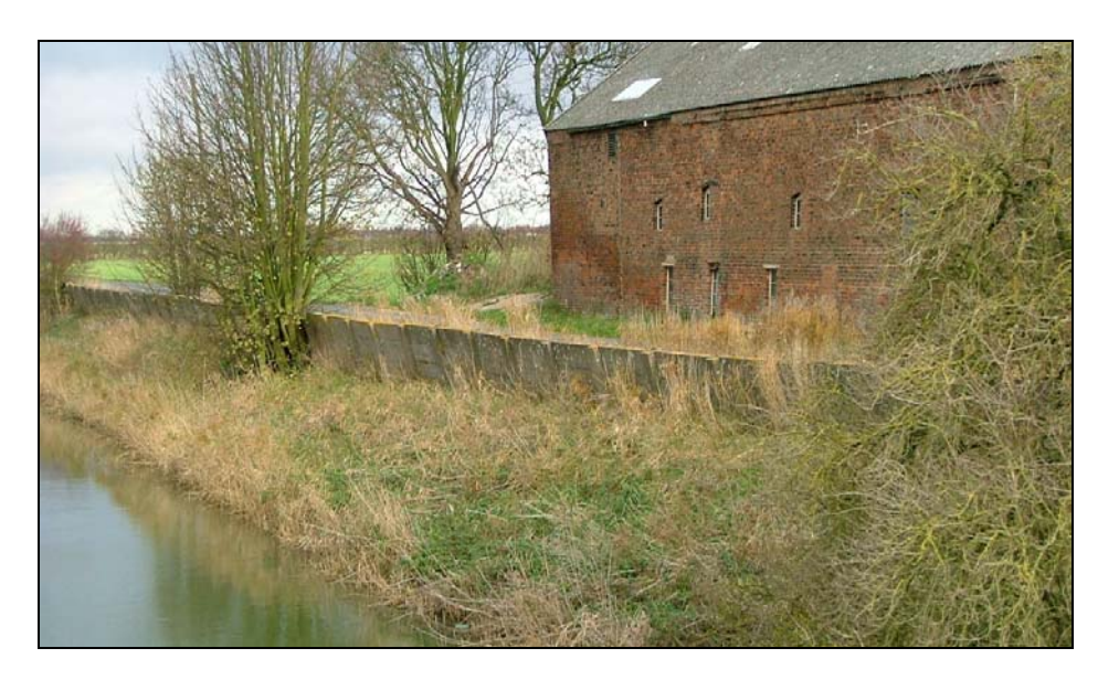
Photograph 3.2 - Leaning wall downstream of Fire Beacon Bridge

Grass banks line the majority of the channel. Where wharfs existed, e.g. at Riverhead, the channel bank is lined by a brick retaining wall. The brickwork walls have been affected by tree roots and generally are in a poor state of repair. Some sections have recently been repaired. There are a number of walls which are leaning, e.g. Fire Beacon (see Photograph 3.2).