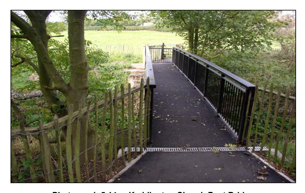
Photograph 5.14 - Keddington Church Foot Bridge

Keddington Church Foot Bridge (Eastfield Foot Bridge) (see Photograph 5.14) – With insufficient water depth dredging of the channel by some 0.8m depth would be required at this location. The existing deck level provides insufficient headroom. The bridge requires raising by approximately 2.7m, such a rise would involve significant works on the approaches. A swing bridge as with the original Navigation would overcome these impacts. If the bridge and public footpath were relocated downstream of Keddington Lock to enable a lower water level and hence bridge level then the amount of bridge raising would be significantly lower at 0.6m.