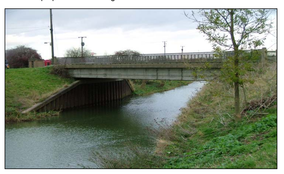
Photograph 5.1 - Tetney Lock Main Bridge

Main Lock Bridge at Tetney Lock (see Photograph 5.1) – With sufficient water depth and headroom no work is proposed to this bridge.