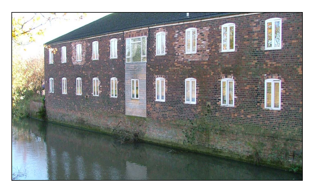
Photograph 2.6 - Warehouse converted to residential use at Riverhead, Louth