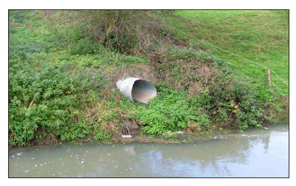
Photograph 8.6 - LMDB South Drain Outfall, downstream of Alvingham Lock