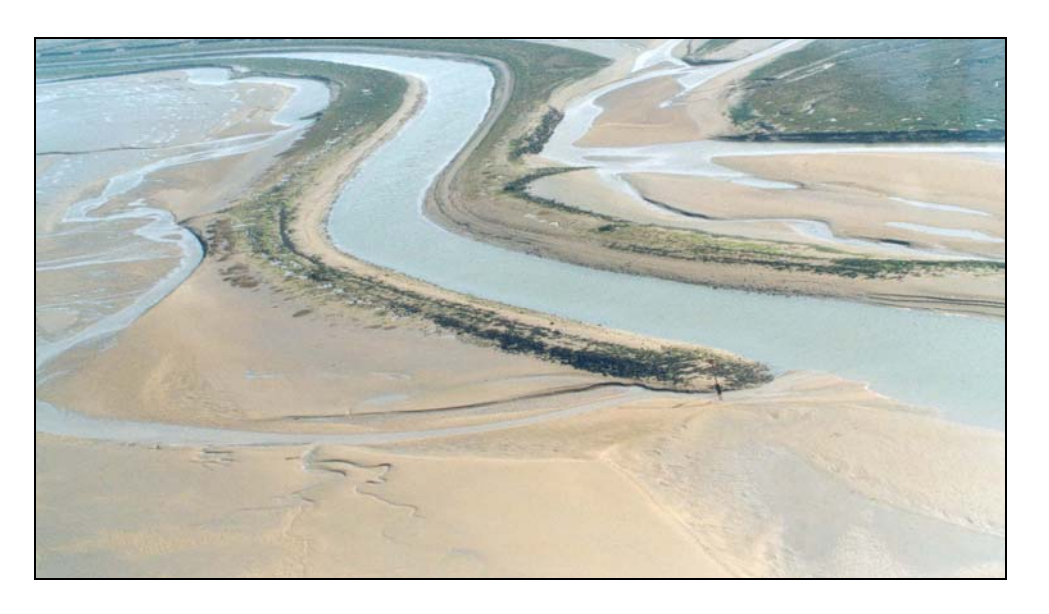
Photograph 3.6 - Tetney Haven tidal channel

For navigational safety purposes the tidal channel downstream of the tidal gates (see Photograph 3.6) would need to be periodically marked out. Currently, the Humber Yacht Club marks out the lower reach of the channel. Due to shifting sands the navigation channel is constantly in flux and the channel may need to be marked out a couple of times per year.