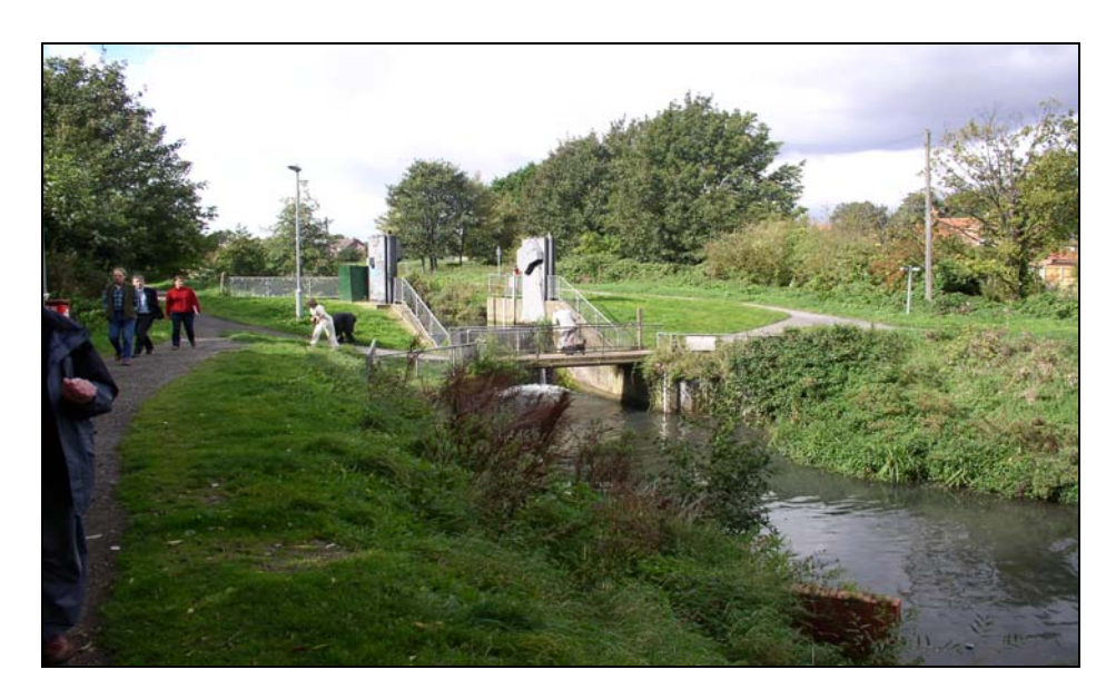
Photograph 5.15 - Environment Agency Louth Tilting Weir and foot bridge on site of Old Top Lock

The provision of fixed bridges could be preferable to the provision of swing bridges due to the lower maintenance costs of maintaining fixed bridges (e.g. mechanical works of swing bridges require regular greasing and servicing, traffic lights and barriers require maintenance). LCC has indicated a preference for fixed structure due to fixed structures having less maintenance requirements. Fixed bridges cannot be left open by accident or otherwise. In some instances fixed bridges may not be practical due to the works required to provide ramp accesses for vehicular or pedestrian access. Further consideration of the type of works will need to be made at detailed design stage in consultation with landowners and statutory authorities.