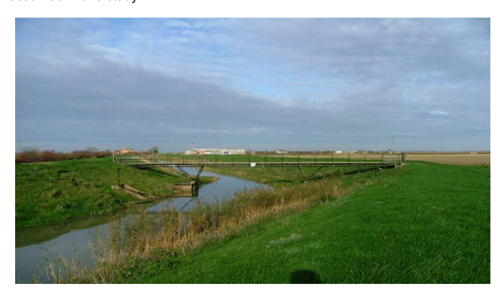
Photograph 5.8 - Austen Fen Foot Bridge and outfalls from LMDB Austen Fen Pumping Station

Austen Fen Foot Bridge (see Photograph 5.8) – With insufficient water depth dredging of the channel by some 0.9m depth would be required at this location. The existing deck level provides sufficient headroom and would not need to be raised. However, any increase in the proposed retained water level although reducing the required dredging depth would reduce the available headroom with the potential result that the level of the bridge would then require raising. To provide a bed width of 7.5m through the bridge could require its replacement or significant works to maintain stability. However, a reduction in the required bed width at this location would mean that this bridge could be retained. A reduction in design bed width to 4.6m has been assumed in this study.