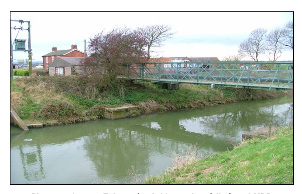
Photograph 5.4 - Fulstow footbridge and outfalls from LMDB Fulstow Pumping Station

Fulstow Foot Bridge (see Photograph 5.4) – With insufficient water depth dredging of the channel by some 0.9m depth would be required at this location. The existing bridge deck provides sufficient headroom and would not need to be raised with the proposed pound levels. However, any increase in the proposed retained water level although reducing the required dredging depth would reduce the available headroom with the potential result that the level of the bridge would then require raising. To provide a bed width of 7.5m through the bridge could require its replacement or significant works to maintain its stability. However, a reduction in the required bed width at this location would mean that this bridge could be retained. A reduction in design bed width to 4.6m has been assumed in this study.