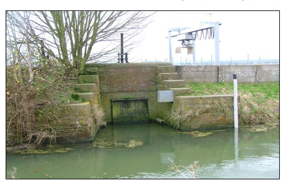
Photograph 8.5 - Outfall from Lindsey Marsh Drainage Board Thoresby Bridge Pumping Station