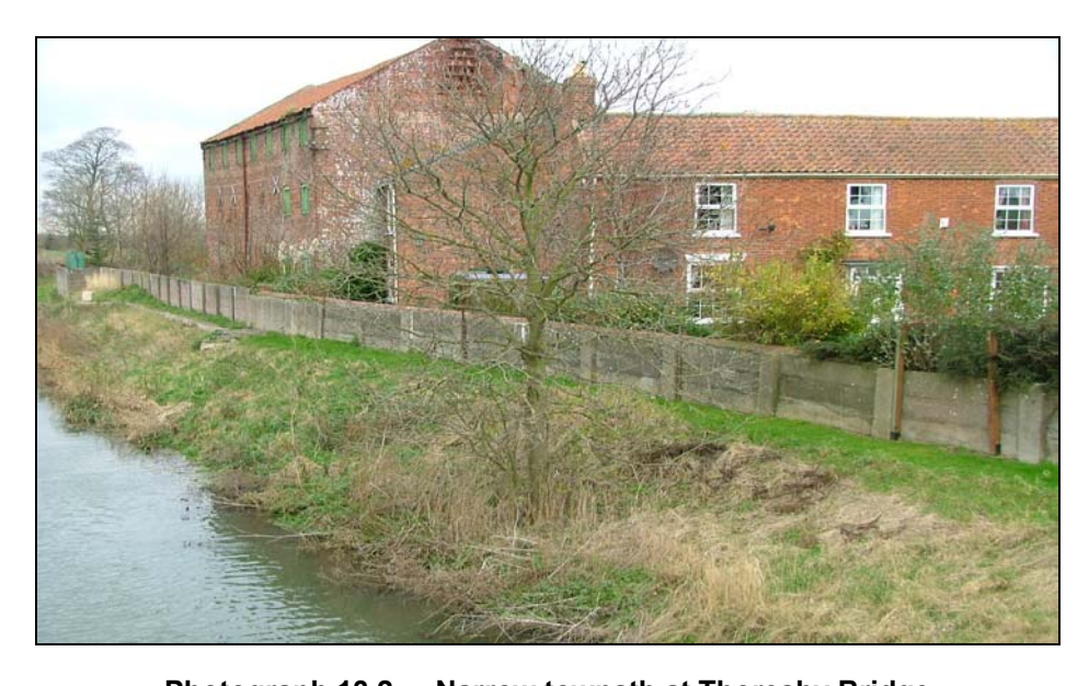
Photograph 13.2 - Narrow towpath at Thoresby Bridge

■ There is a significant pinch point at Thoresby Bridge where the towpath is narrow due to adjacent buildings creating an obstruction to wheelchair users. If the canal cannot be narrowed to provide additional towpath width it maybe possible to negotiate access through adjacent private land (see Photograph 13.2).