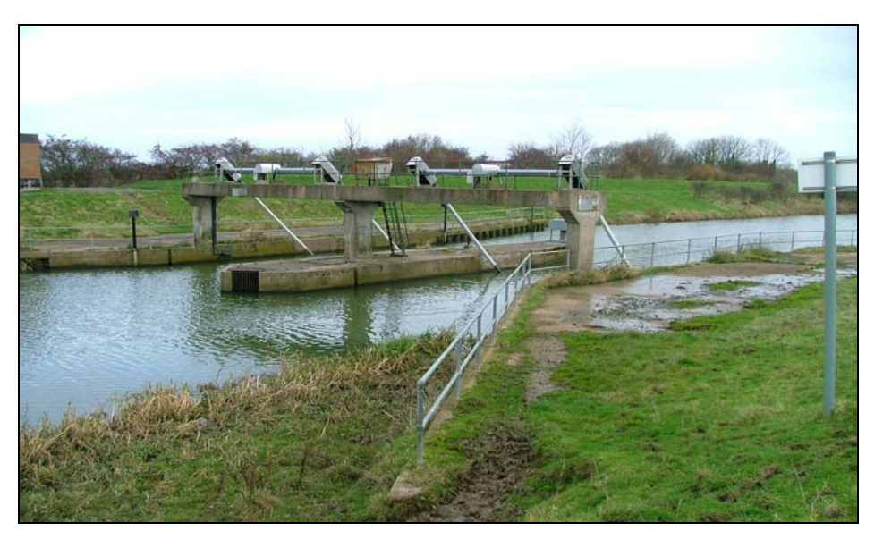
Photograph 7.6 - Anglian Water Tilting Weir downstream of Tetney Lock

The Anglian Water tilting weir (see Photograph 7.6) at Tetney Lock should be retained to minimise the risk of saline water being drawn further upstream.