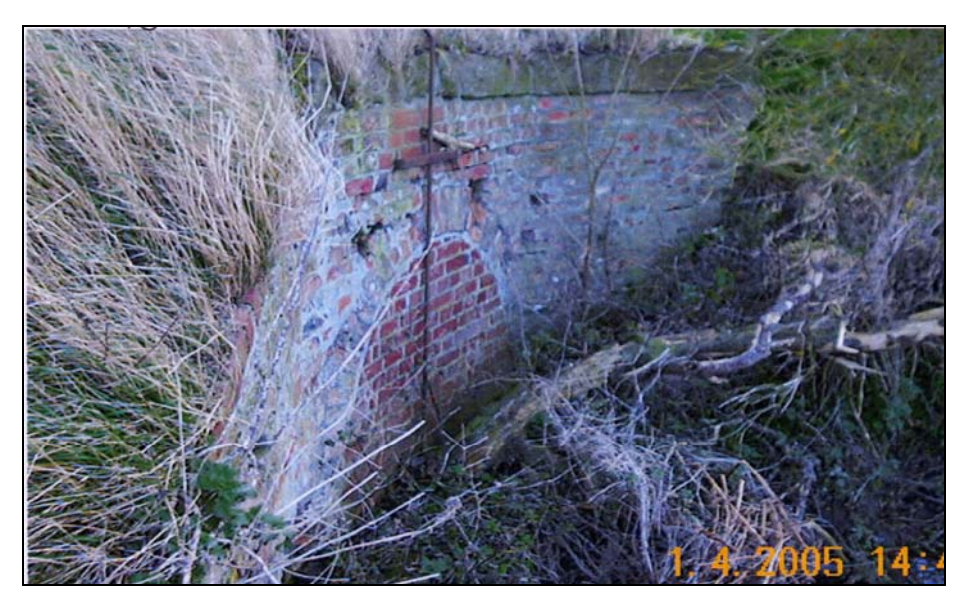
Photograph 7.4 - Abandoned and Bricked up Alvingham Lower Syphon (Upstream side)

Lindsey Marsh Drainage Board maintains Westfield Drain and the Mill Stream from the River Lud upstream of the Alvingham Upper Syphon. The Alvingham Upper Syphon and the Mill Race are maintained by the landowner.