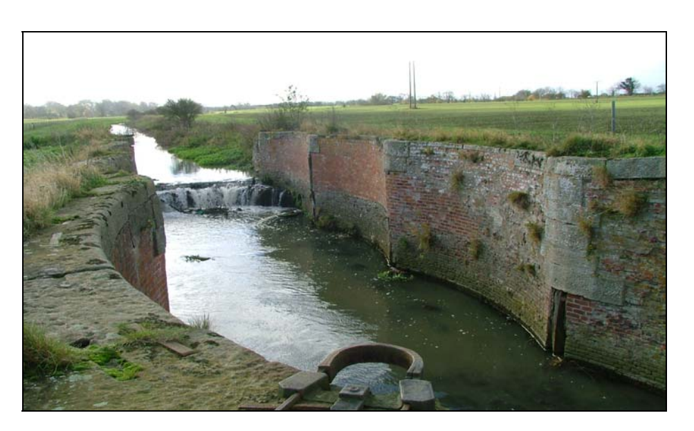
Photograph 4.4 - Willows Lock - Note gates have been removed

4.8 Willows Lock – This lock, sometimes referred to as Carrotts Lock, consists of barrel arch sided brick walls with stone copings (see Photograph 4.4). The lock is in a reasonable condition except for the invert, which due to its timber beam construction has been subject to significant scour. The original invert timbers have decayed increasing the amount of scour. The walls are showing signs of leading inwards. However, of all the locks along the Louth Canal, Willows Lock is the best remaining example of the unique barrel arch wall design and should be restored.