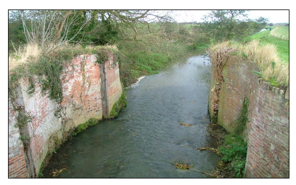
Photograph 4.5 - Ticklepenny Lock - Note gates have been removed

Keddington Church Lock – This lock consists of barrel arch sided brick walls with stone copings (see Photograph 4.6). The Environment Agency has placed stone filled gabions to support the lock's deteriorating brick walls. The lock is in a very poor condition and a new lock is required. A fairly well used local path crosses the centre of the lock chamber. A fixed metal footbridge has replaced the original timber swing bridge. Restoration of the existing chamber to navigation would require that bridge to be either raised or moved.