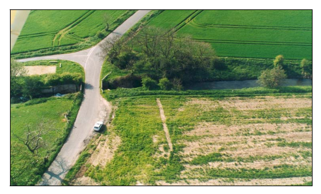
Photograph 5.13 - Aerial view of Ticklepenny Lock and Bridge

Keddington Church Foot Bridge (Eastfield Foot Bridge) (see Photograph 5.14) – With insufficient water depth dredging of the channel by some 0.8m depth would be required at this location. The existing deck level provides insufficient headroom. The bridge requires raising by approximately 2.7m, such a rise would involve significant works on the approaches. A swing bridge as with the original Navigation would overcome these impacts. If the bridge and public footpath were relocated downstream of Keddington Lock to enable a lower water level and hence bridge level then the amount of bridge raising would be significantly lower at 0.6m.