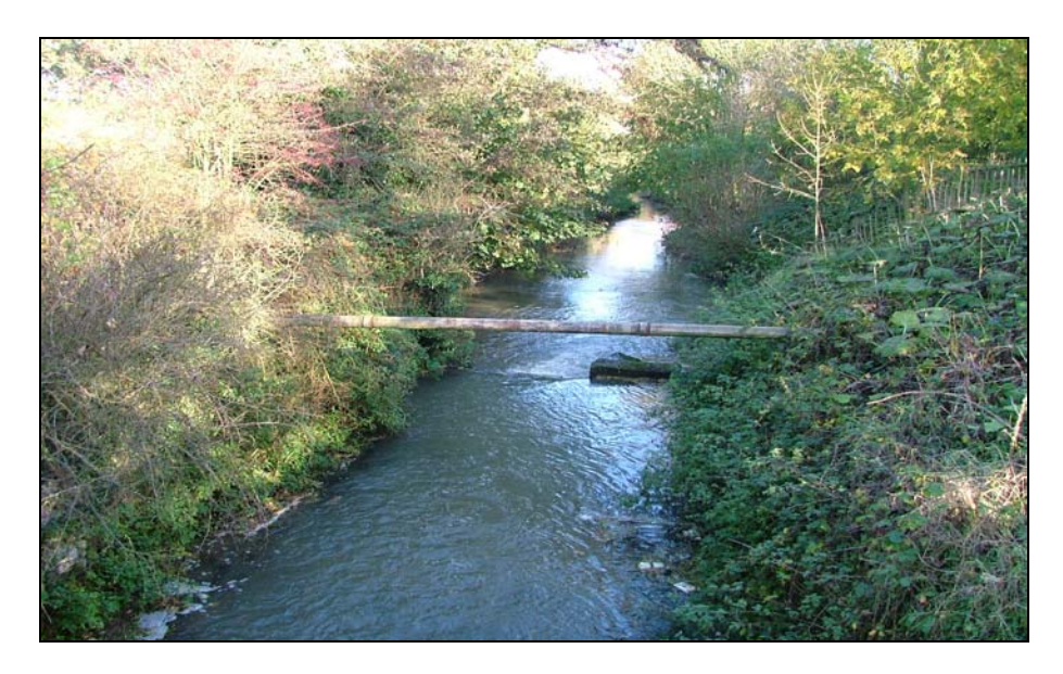
Photograph 8.2 - Water main downstream of Keddington Church Lock

In addition to the mains that cross the canal the following outfall is operated by Anglian Water: