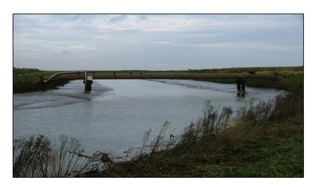
Photograph 8.4 - Oil Transfer Pipeline across Tetney Haven

ConocoPhillips has confirmed that a 36" diameter crude oil transfer pipeline (see Photograph 8.4) crosses the Tetney Haven on the seaward side of the tidal lock gates (Tetney Lock). The pipeline in its current position would impede access for vessels into the Navigation at high tide.