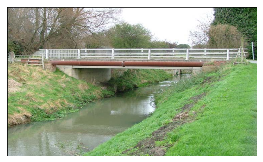
Photograph 5.11 - Alvingham Lock Bridge and Pipebridge (water main)

River Farm Bridge (see Photograph 5.12) – With sufficient water depth no dredging is required at this location but the existing deck level provides insufficient headroom. A swing bridge as with the original Navigation or new bridge raised by 1.8m is required.