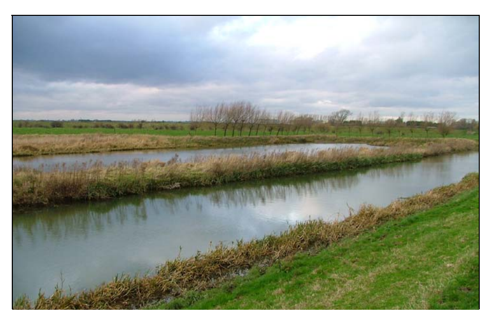
Photograph 3.5 - Fish Refuge area between Thoresby Bridge and New Delights

3.15 As well as the fish refuse there is an offline flood storage area between Thoresby Bridge and New Delights, which is used by the Environment Agency for flood risk management purposes.